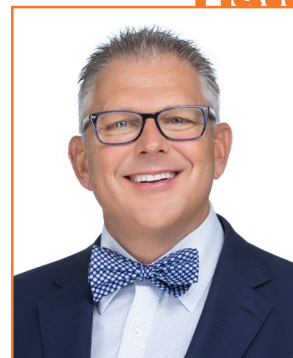
CEO, Greater Topeka Partnership