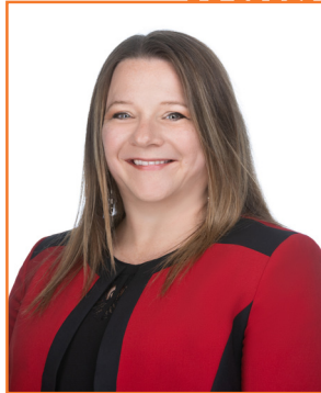
Director, Business & Talent Initiatives