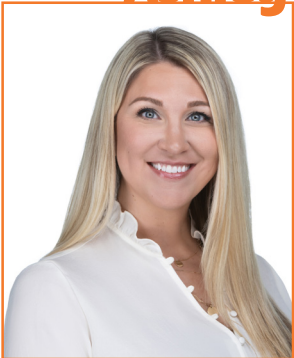
Director of Business Development