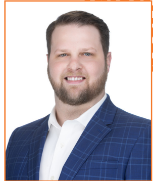
Executive Director of Forge Young Talent