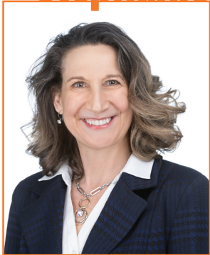
SVP of Innovation