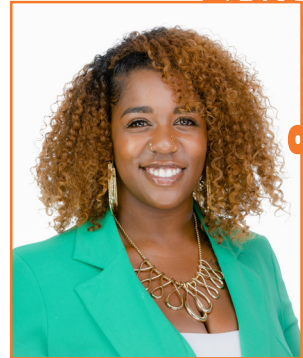
Marketing Project Manager