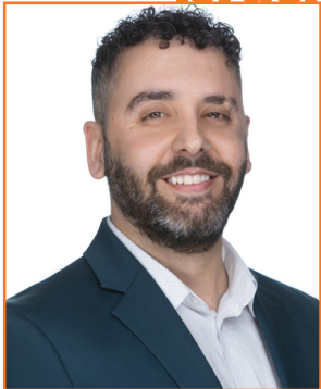
Director of Equity & Business Development