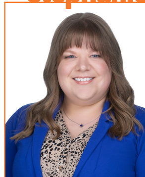
Director of Entrepreneurship & Small Business