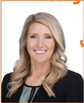
President, GO Topeka